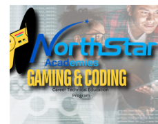
Gaming & Coding