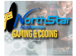
Gaming & Coding